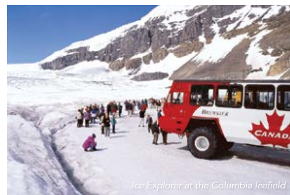
Ice Explorer at the Columbia Icefield

From identifying a wildflower to describing the formation of the Columbia Icefield, the company and keen eye of an expert Orbridge Expedition Leader will make all the difference. Enriched by their expertise, bring home a deeper understanding of the flora, fauna, cultural history, and natural characteristics of the Canadian Rockies—to go with your beautiful photographs, of course.