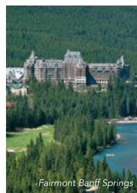
Fairmont Banff Springs