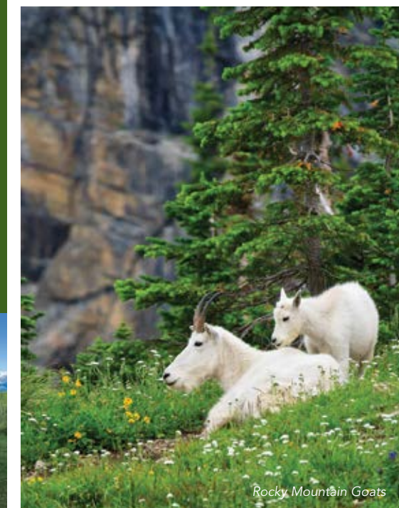
Rocky Mountain Goats

Go online for more photos, itinerary details, and to reserve your space now. See reverse for the web address.